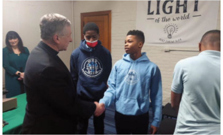
Cardinal Blase Cupich shakes hands with students from the Academy of St. Benedict the African, our recipient school for our School Supplies Drive this year.