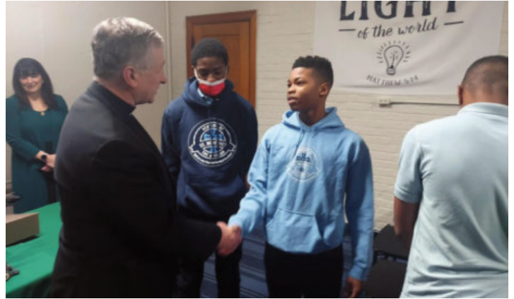
Cardinal Blase Cupich shakes hands with students from the Academy of St. Benedict the African, one of our recipient schools of our School Supplies Drive

VOLUNTEERS SIGN UP HERE! If you are interested in assisting with the drive, we can use your help! Your participation is an invaluable part of the success of