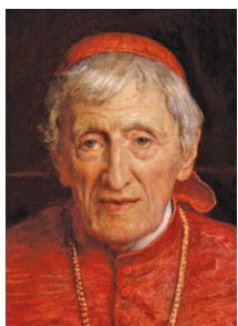
St. John Henry Newman

Realize it, my brethren; everyone who breathes, high and low, educated and ignorant, young and old, man and woman, has a work. We are not sent into this world for nothing; we are not born at random; God sees every one of us; He creates every soul. He deigns to need, every one of us. He has an end for each of us; we are all equal in His sight, and