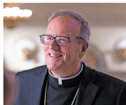
Bishop Robert Barron