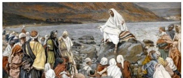
Sermon on the Plain