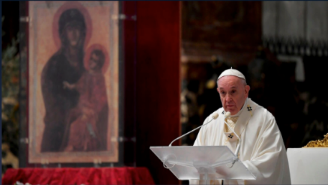
Prayers for the Month of May

Click on image above for the Pope's prayers