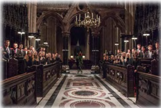
The choir in Durham Cathedral just before the annual Advent Procession