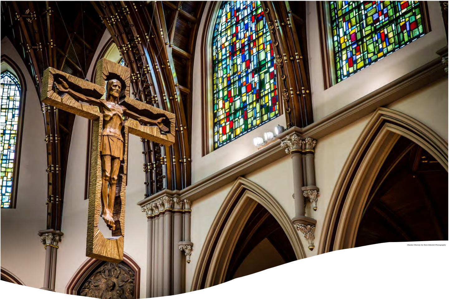
Charles Cherny for Kate Oelrich Photography