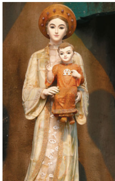
Our Lady of Lavang

October is the month of the Holy Rosary, when we are reminded that we all share a spiritual Mother. In Mary, we see glad tidings she wants to give her children. St. Irenaeus says, “Just as the former [Eve] was led astray by the word of an angel so that she fled from God when she had transgressed His word; so did the later [Mary], by an angelic communication, receive the glad tidings that she should be the bearer of God, being obedient to His word. And if the former did disobey God, yet the latter was persuaded to be obedient to God, in order that