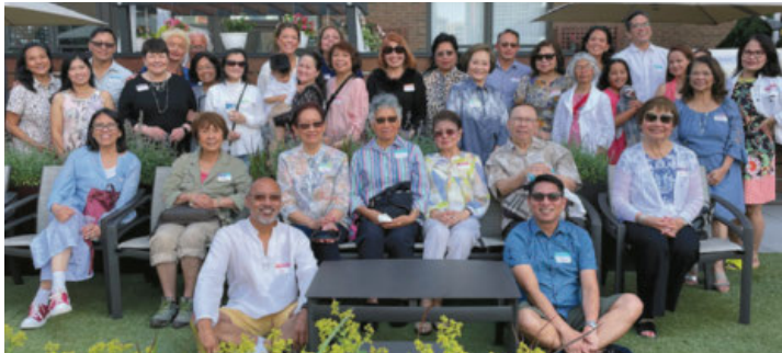
The Cathedral Filipino Network (CFN) Summer Outing last June 9, 2023.

“I can’t see well enough to shop online so I’ll just drive to the store!”