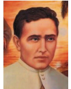
St. Damien of Molokai

Each offers spiritual nourishment, and yet, the thirst for more leads the pilgrim to the next mansion, which provide even more profound nourishment for the soul.