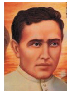
St. Damien of Molokai

Considered an unlikely candidate for the priesthood, Fr. Damien lived the Gospel, preaching, caring, and advocating for the residents of the Hawaiian leper colony on the Kalaupapa Peninsula. His ministry is one of accompaniment with the marginalized. Together, we will recognize how Damien's spirituality may parallel Pope Francis' Art of Accompaniment.