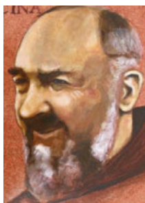
St. Pio Pietrelcina

On the third Sunday of each month after the 5:15pm Mass, we will hold a gathering when a layperson presents a Catholic saint or other Catholic legendary hero